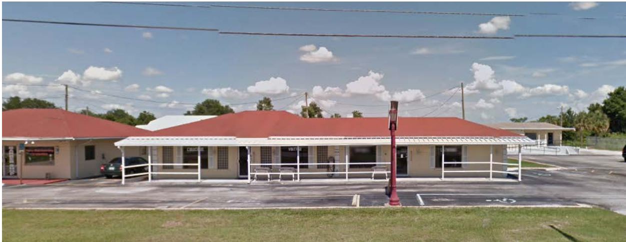
1504 Lake Alfred Rd – looking east at the site.